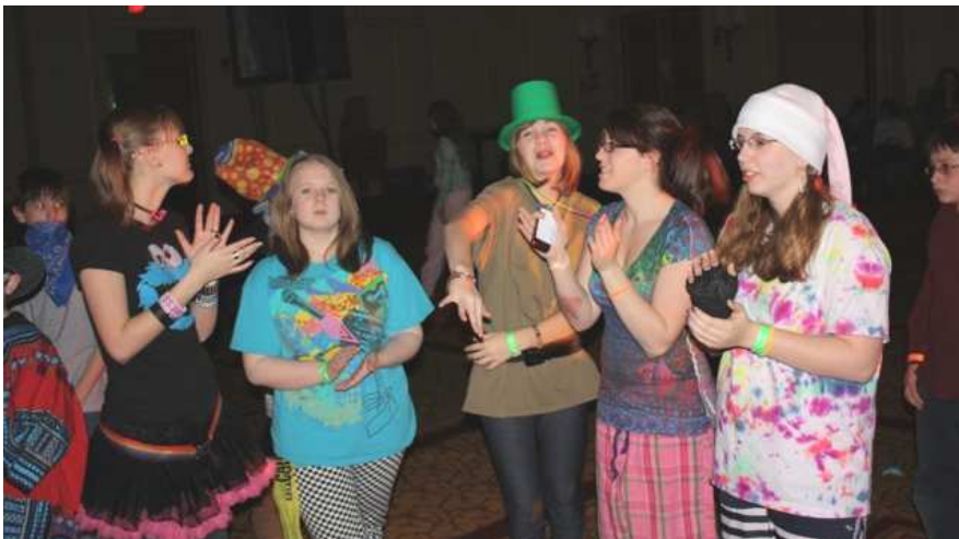
A good time was had by all at this year's Youth Quake in January.