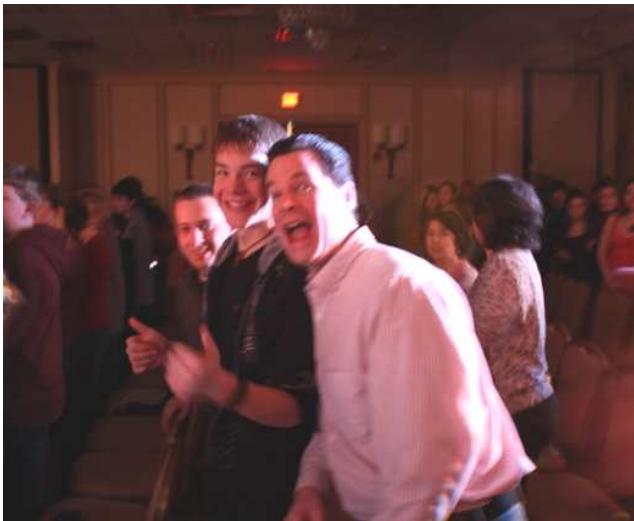
YOUTH QUAKE 2010